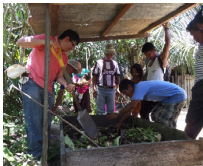
Producers of the cooperative Agraria Kampu Piyahui preparing compost, Bajo Paranapura, Alto Amazonas province, Loreto region

For the original article in Spanish and for more information, contact the authors: alujansanches@yahoo.es ; liliavensur@terranuova.org.pe