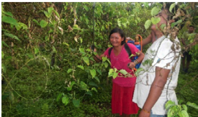
Producers of Sacha inchi from the Shakaim Agrarian Cooperative apply a self made liquid biofertilizer, Datem del Marañón province, Loreto region.

supported through the project, opening an interesting path by placing typical Amazonian products on local and even national markets. These cooperatives decided to re-organize themselves, following the principles of PGS, by creating several local groups to enhance the internal social control.