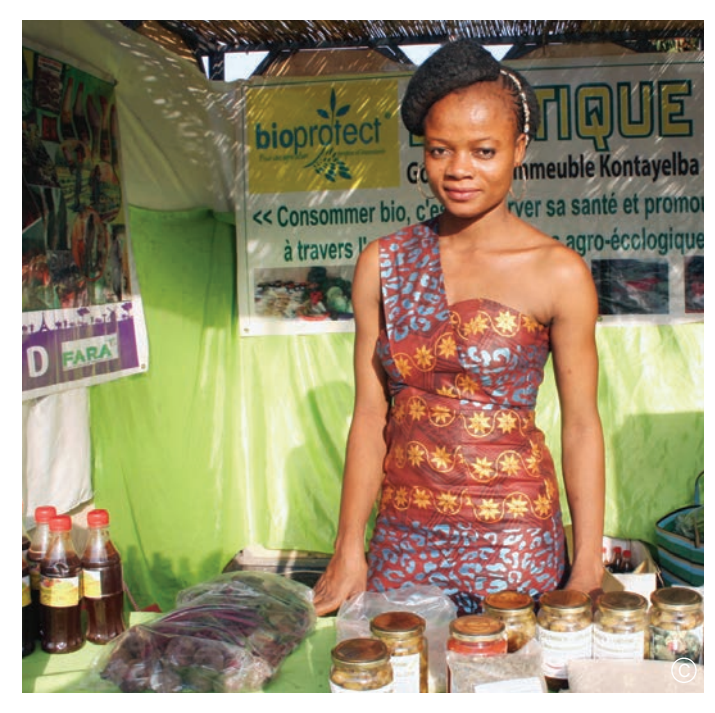
An agricultural producer at the Bio Fair in Burkina Faso

2018 saw the project begin with kick-off workshops in the four project countries: Ghana, Burkina Faso, Togo and São Tomé and Principe. In the first project year a stakeholder analysis was conducted, initial Participatory Guarantee System (PGS) trainings took place and PGS initiatives were identified. Furthermore, the selected value chains (cassava in Ghana, shea butter in Burkina Faso, cocoa in São Tomé and Principe and pineapple in Togo) benefitted from assistance for further development.