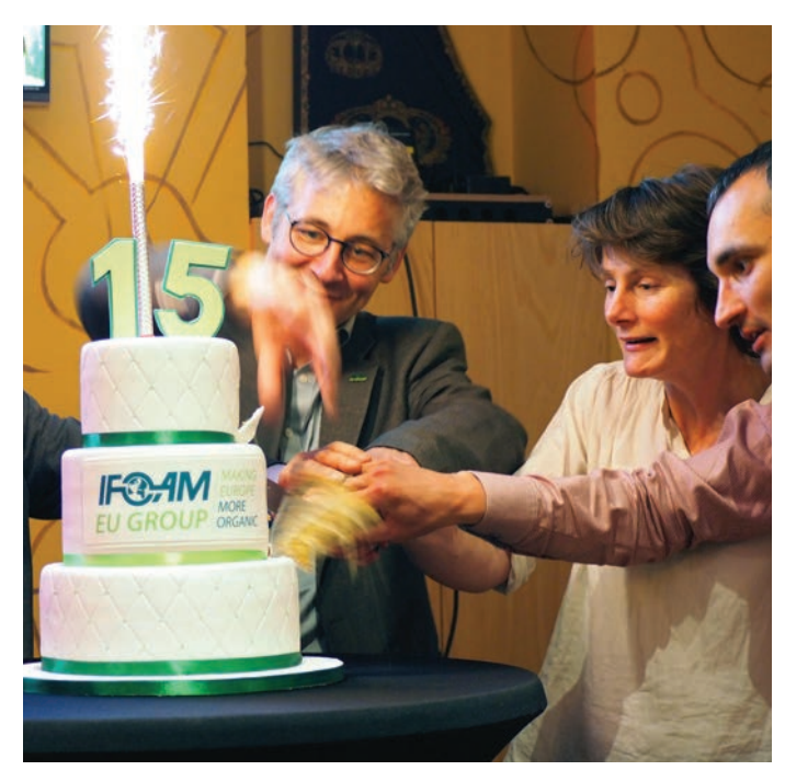
Happy 15th anniversary, IFOAM EU Group!

engineering techniques are GMOs and must therefore be regulated as such, something IFOAM EU had actively advocated for.