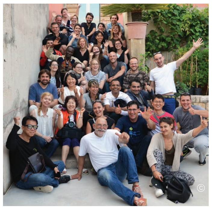
OLC Europe 2018 alumni during a face-to-face training in Croatia

We encourage the exploration of ideas and visions for organic and facilitate exchange between participants from