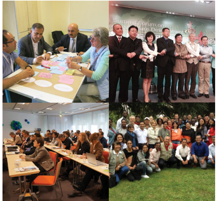
The Sector Platforms in Action.