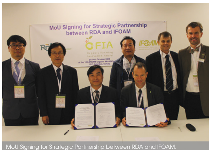
MoU Signing for Strategic Partnership between RDA and IFOAM.

We congratulate the winners and look forward to honoring more organic farming innovators at the next OFIA ceremony!