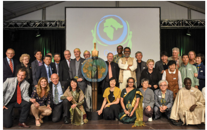
OWA - The Winners 2014